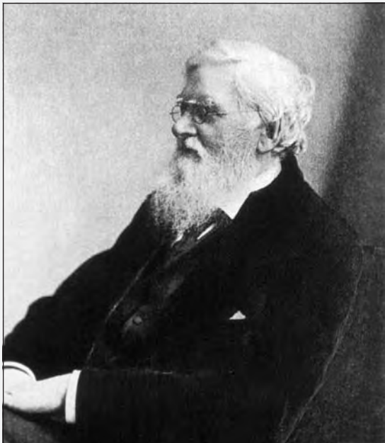
Alfred Russel Wallace independently proposed a theory of evolution very similar to that of Darwin.